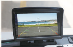
9 inch touchscreen with back-up camera