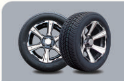
14" Aluminum Wheel with color insert/215/35R14 Radial DOT Tire