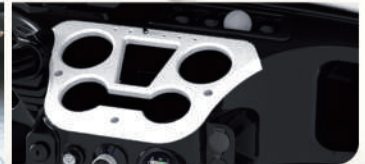
Color matched Dash with four cup holders/cell phone holder