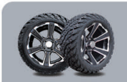
14" Color Matched Silent Tire with Off-road Thread