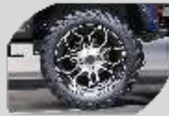
Silent Tire with Off-road Thread