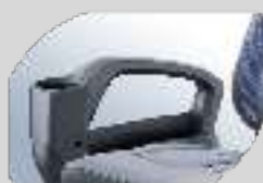
Rear Armrest With Built-in Storage Compartment