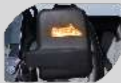
Powered Rear View Mirrors