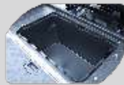
Rear Storage Compartment