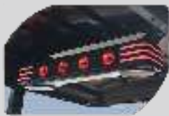
Cuboid Evolution Sound Bar