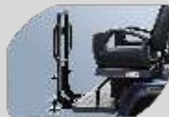
Rear Handrail with Optional Towing Hitch Receiver