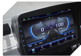
9" Multi-Functional Touchscreen