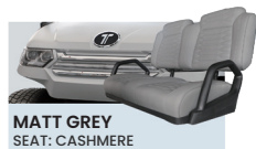
MATT GREY SEAT: CASHMERE