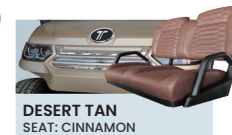
DESERT TAN SEAT: CINNAMON