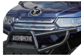
LED Headlights and Turn Signals