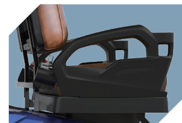
Rear Armrest with Built-In Storage Compartment