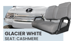
GLACIER WHITE SEAT: CASHMERE