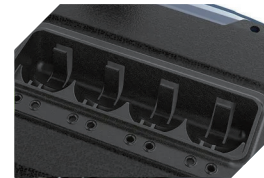
Golf Ball Holder