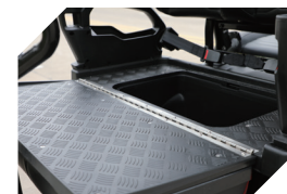
Folding Seats & Storage Compartment