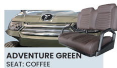
ADVENTURE GREEN SEAT: COFFEE