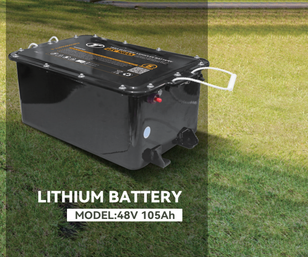
LITHIUM BATTERY MODEL:48V 105Ah