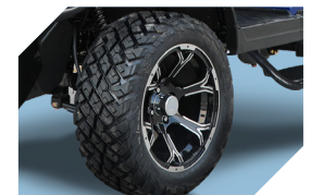
23x10-14" Silent Tire with Off-Road Thread