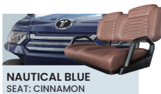
NAUTICAL BLUE SEAT: CINNAMON