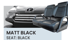
MATT BLACK SEAT: BLACK