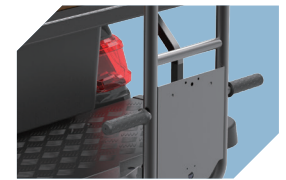
Rear Handrail with Footrest